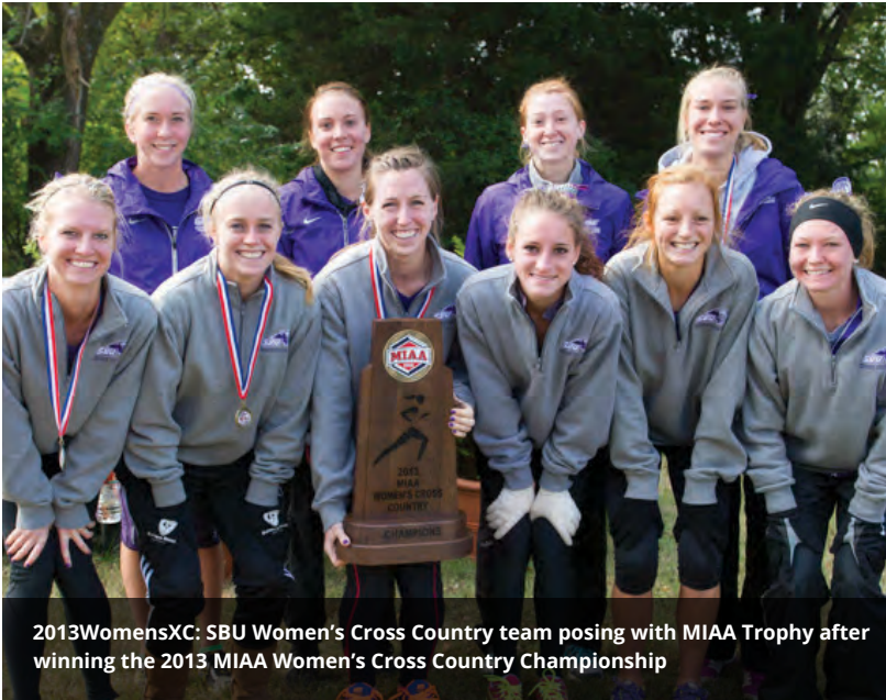
2013WomensXC: SBU Women's Cross Country team posing with MIAA Trophy after winning the 2013 MIAA Women's Cross Country Championship